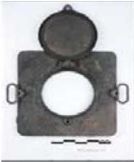
Hatch after conservation.