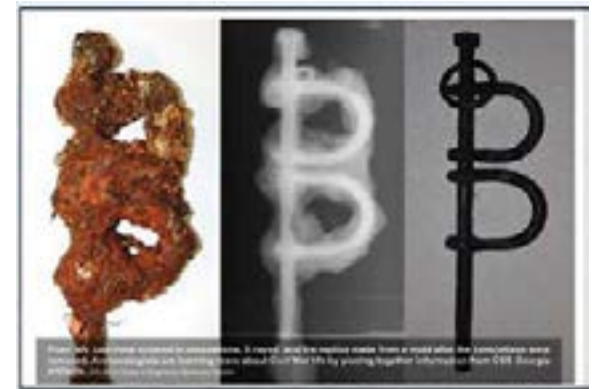
Leg irons for unruly sailors.

Event: Paleoindian Program – Ocmulgee National Monument