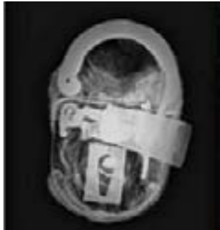
Padlock x-ray.