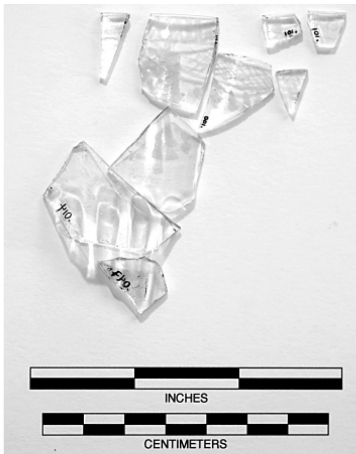
Figure 1. English leaded crystal from Fort Daniel.

GARS Historian Shannon Coffey continues to work on artifact cleaning, cataloguing and—her special area of interest—analysis of ceramics and glass. In addition to wonderful examples of (early) hand-painted polychrome pearlware (a bowl and accompanying pieces, probably teacups, dating to 1795–1820), possibly English-made banded annular ware (a mug dating to 1785–1840), and brown transfer ware featuring an Asian pastoral scene dating ca. 1810, we have also recently recovered several sherds of imported English wheel-etched leaded crystal (Figure 1). The sherds suggest a tumbler, per-