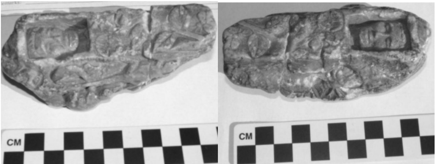
Above and left: Various views of unusual figurine brought to the Jones County Artifact ID Day.