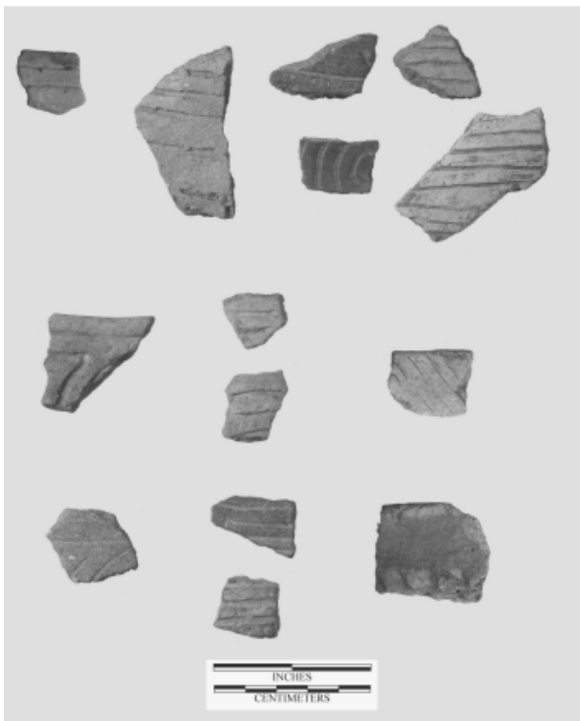
Selected Lamar ceramics recovered from one of the sites investigated along Lake Sinclair.