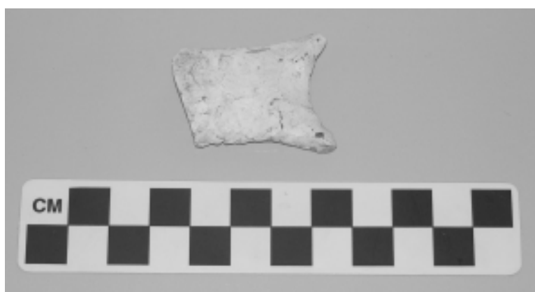
Above: Paleoindian projectile point from Seven Islands Artifact ID Day.